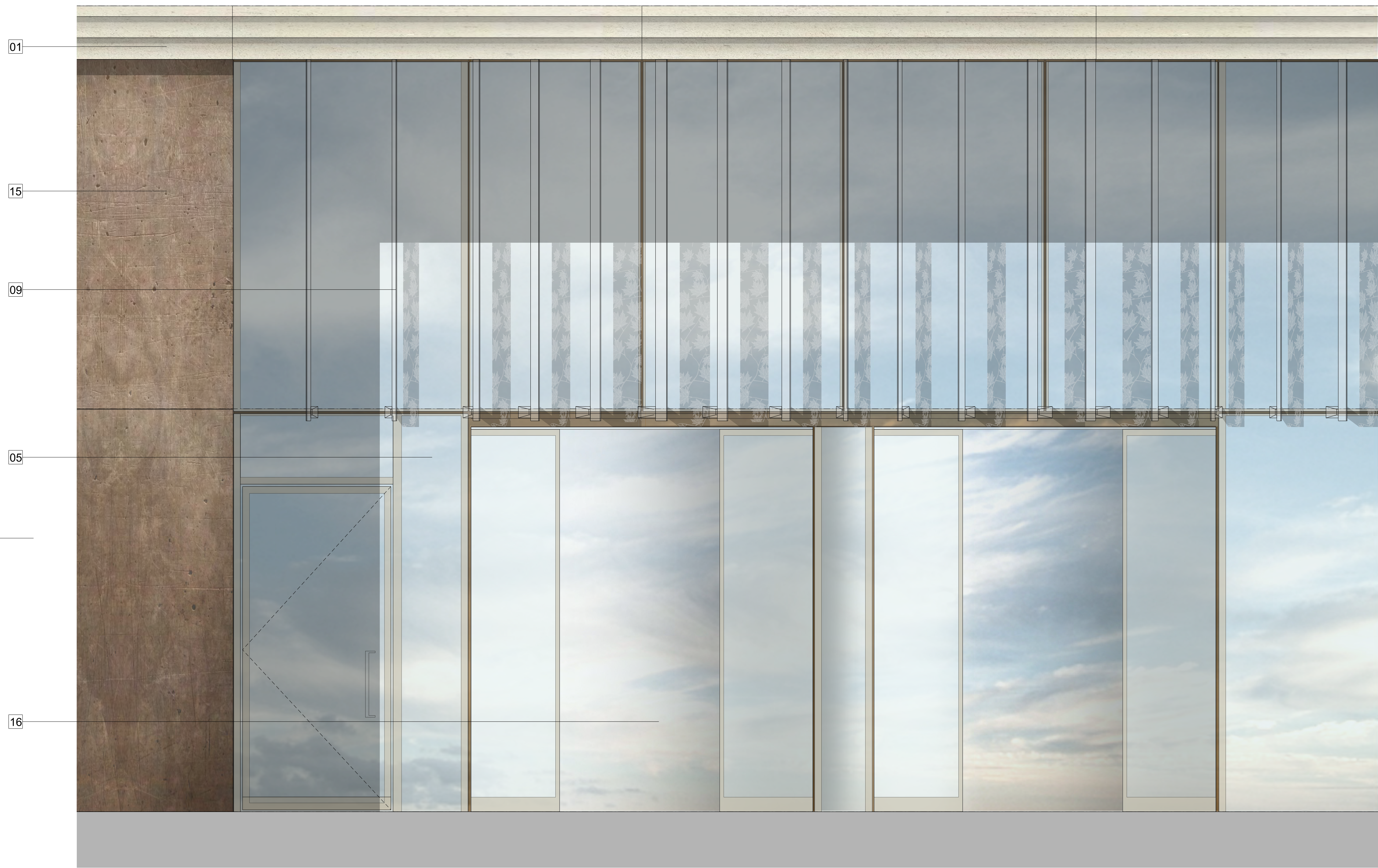
G251 5105-1 Detail Elevation